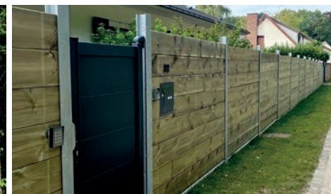
FENCES & MORE