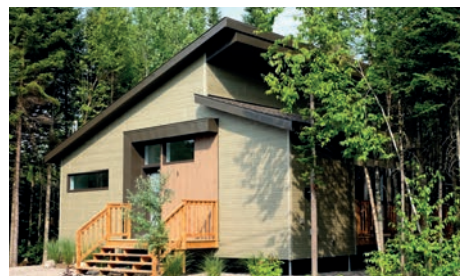
HOMES & COTTAGES