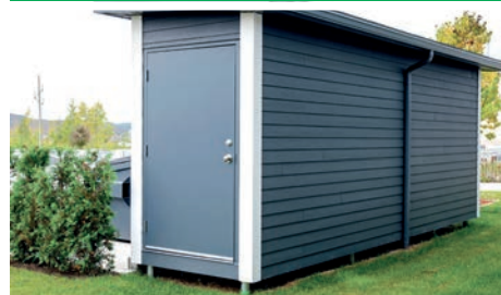
SHEDS & SHELTERS